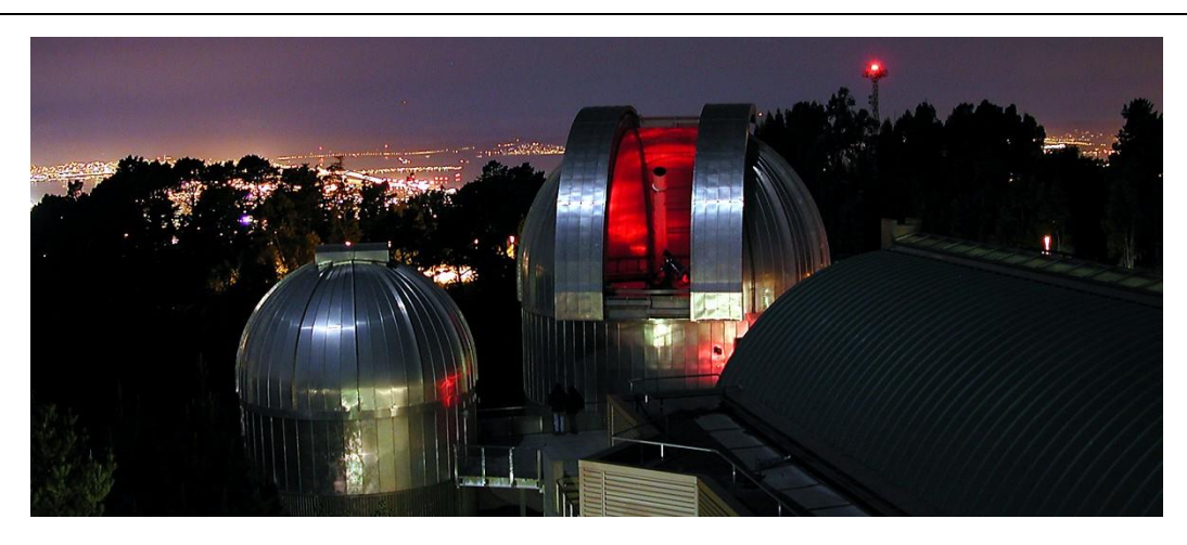
April – Odyssey Overnight

**REGISTRATION REQUIRED via Council Event Page HERE**